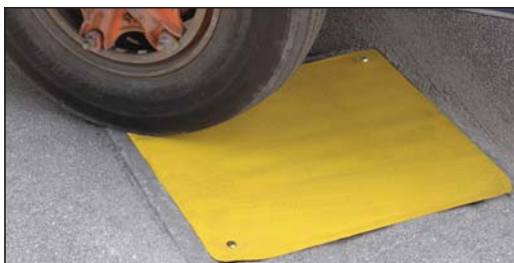
Flexible, non-absorbing bottom layer is reinforced with tear-resistant mesh