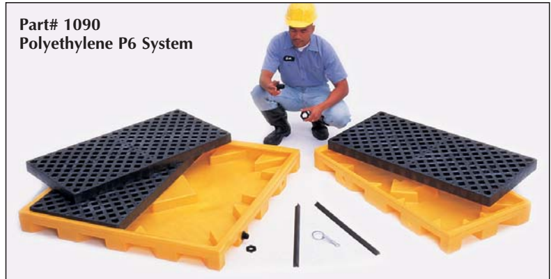
Part# 1090 Polyethylene P6 System

The bulkhead fittings not only “lock” connected modules together, but allow spilled liquid to flow from one module to the next. Ultra-Spill Deck Containment Systems meet SPCC, EPA and Uniform Fire Code Spill Containment Regulations when assembled in configurations of six (6) drums or more.