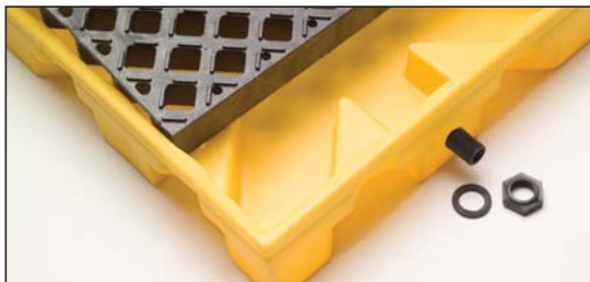
Bulkhead fittings allow spills to flow to adjacent sump areas, increasing containment capacity while maintaining a low profile.