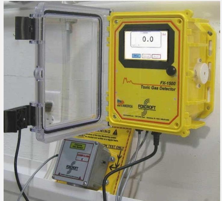
Single Channel FX-1500v4