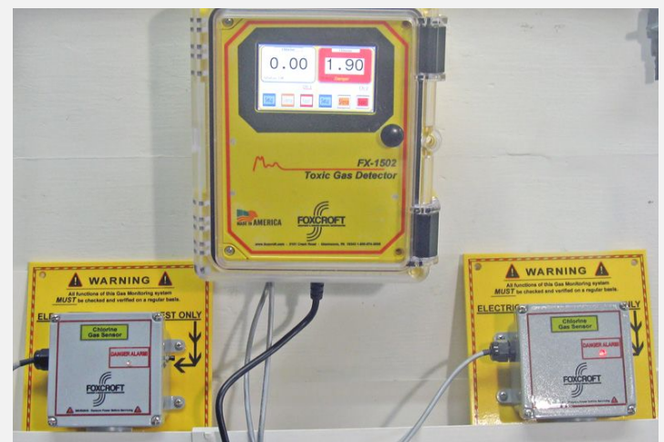
Dual Channel FX-1502v4